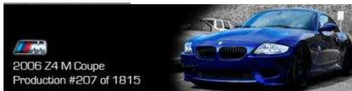
2006 Z4 M Coupe Production #207 of 1815

LINK TO MOD JOURNAL: http://www.zpost.com/forums/showthread.php?t=403119