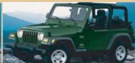
Deep Beryl Green