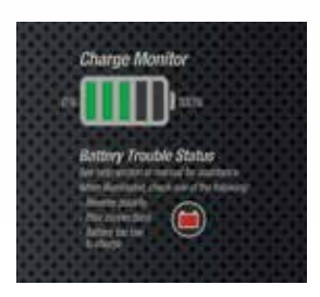
Digital LED Charge Monitor includes battery trouble status indicator