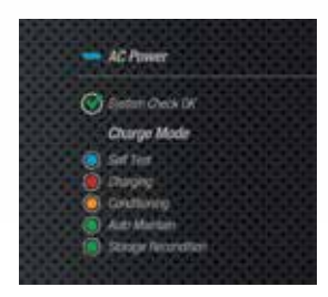
Charge Mode Status Indicator identifies each stage of charging