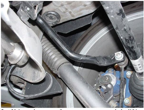
2. Using the manufacturers recommended lifting point(s), raise rear of vehicle and support with jack stands. NEVER WORK ON A VEHICLE SUPPORTED ONLY WITH A JACK!

1. Park car on a flat, level surface capable of supporting the vehicle's weight on jack and jack stands.