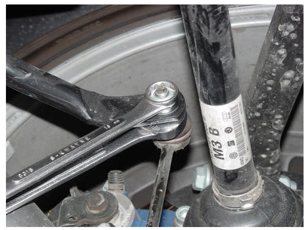
6. Disconnect end links from anti-roll bar by securing stud with 17mm wrench and loosening nut with 16mm wrench. (Left side shown, repeat for right side)