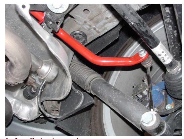
9. Installation is complete.