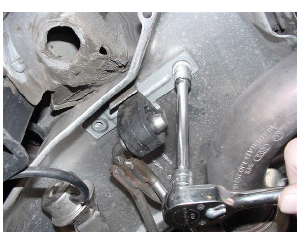
3. Loosen exhaust clamp (17mm Hex) and disconnect exhaust from catalyst. Disconnect left and right exhaust hangars and vacuum hose from diaphragm.