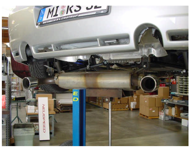
4. Remove exhaust from vehicle.