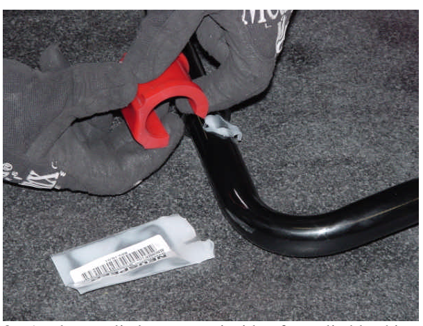
8. Apply supplied grease to inside of supplied bushing and install bushing onto supplied bar. (Left side shown, repeat for right side)