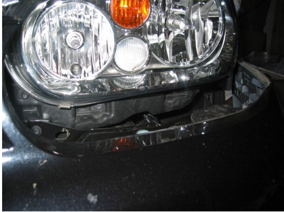
<u>Step 8</u> - Remove the top bolts:

<u>Step 7</u> - With the nuts removed, the bumper should be able to pull slightly forward to expose the lower bolts: (only pull one side forward at a time so you don't have to pull the whole bumper off)