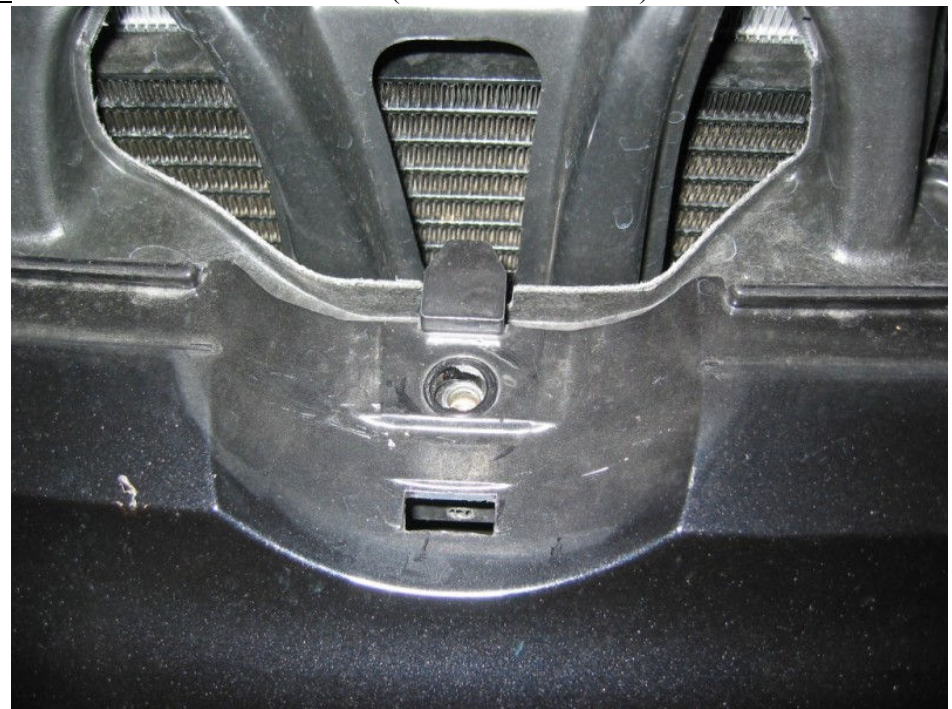
<u>Step 4</u> - Remove the torx bolt here (I think it was a t25):