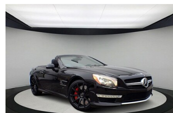
2016 Mercedes-Benz SL AMG SL 6... $79,970