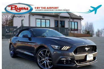
2015 Ford Mustang GT Premium $28,500