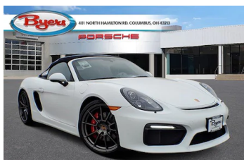
2016 Porsche Boxster Spyder $85,900