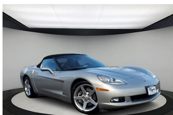
2005 Chevrolet Corvette $22,970