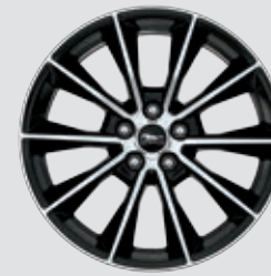
19" Low-Gloss Black-Painted Machined Aluminum Included: EcoBoost Interior & Wheel Package, Wheel & Stripe Package, GT Interior & Wheel Package