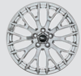
19" x 9" Front/19" x 9.5" Rear Luster Nickel-Painted Aluminum Optional: GT Performance Package