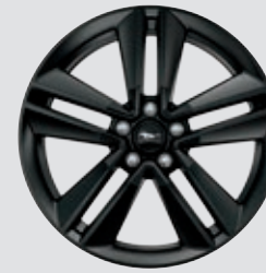
19" Ebony Black-Painted Aluminum Included: EcoBoost Performance Package