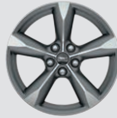
18" Foundry Black-Painted Machined Aluminum Included: V6 051A Optional: EcoBoost, EcoBoost Premium, GT, GT Premium