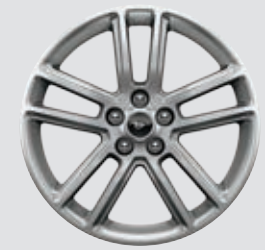
19" Polished Aluminum Included: EcoBoost Premium Pony Package