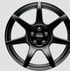
19" x 11" Front/19" x 11.5" Rear Ebony Black-Painted Carbon-Fiber Included: Shelby GT350R Package