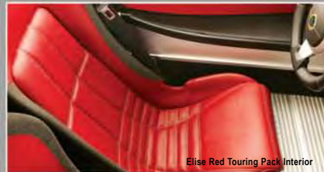
Elise Red Touring Pack Interior