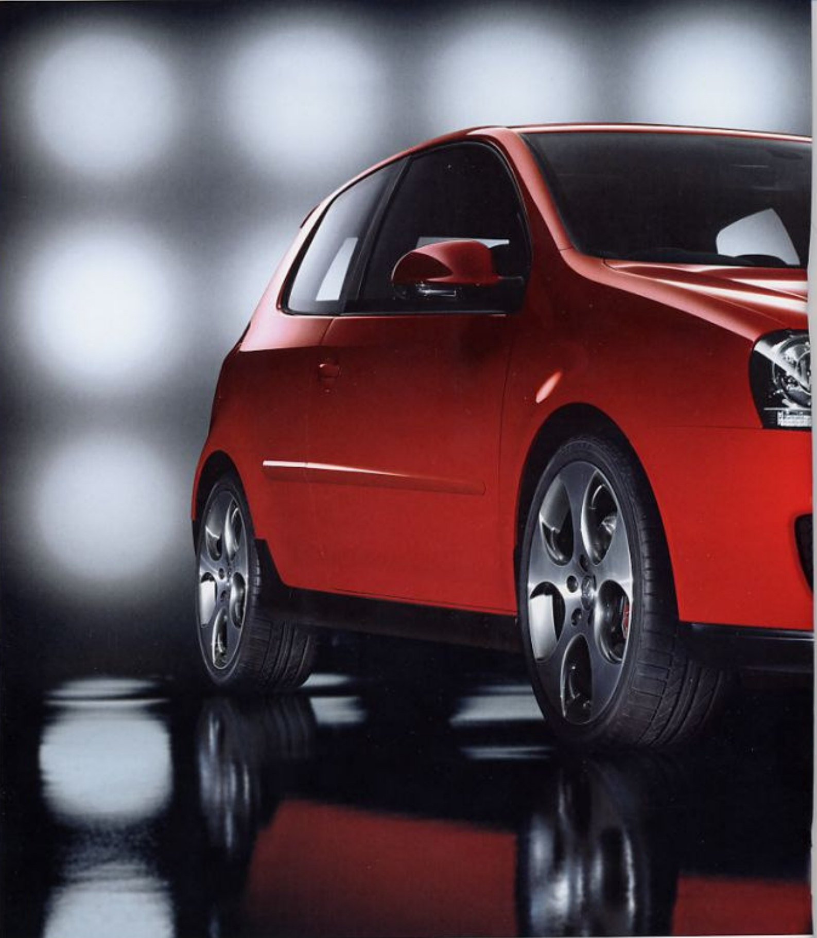
The new Golf GTI with optional 18" 'Monza II' alloy wheels and Xenon headlights.