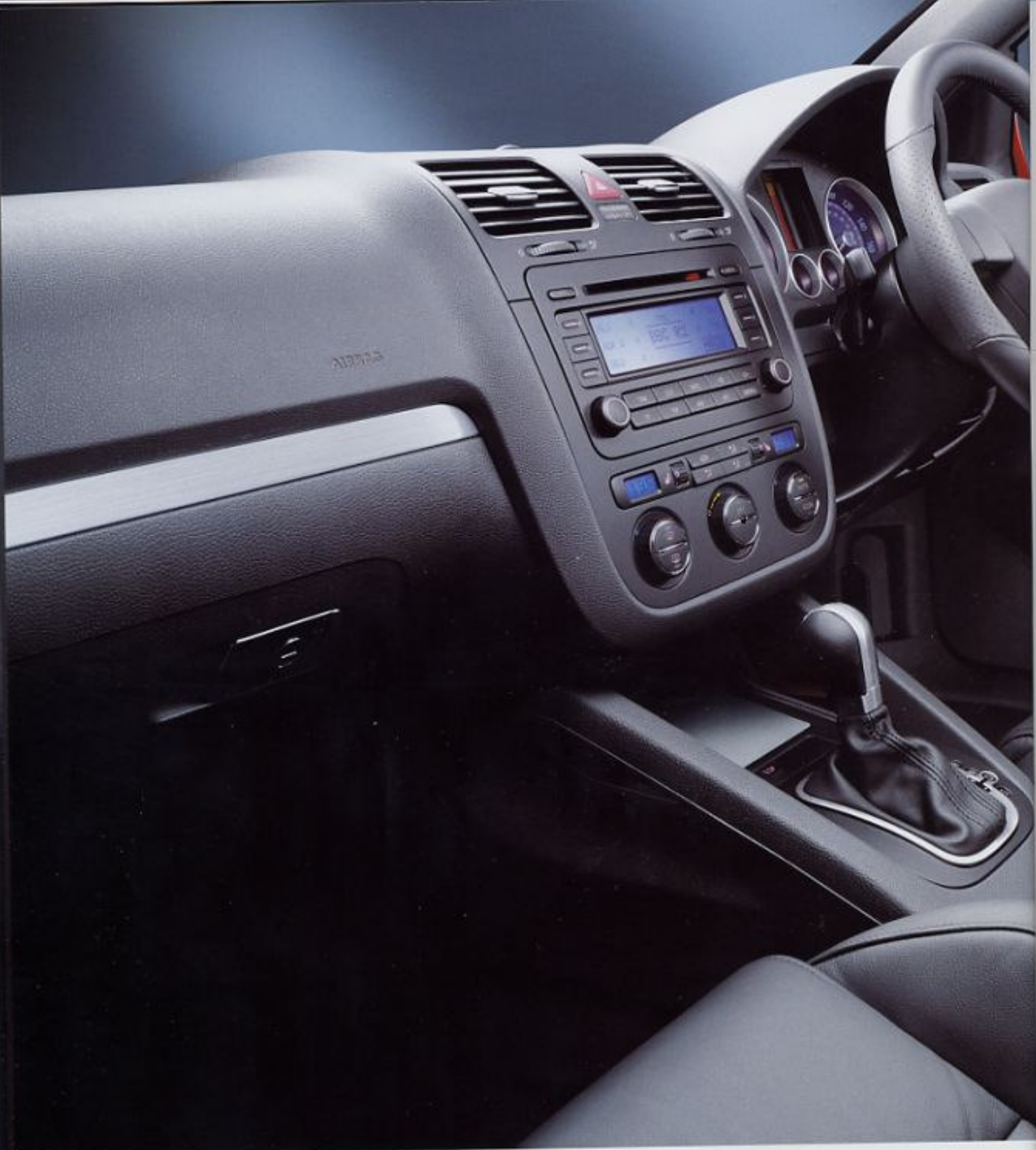
The new Golf GTI 200 PS auto DSG with optional leather upholstery and dash-mounted radio/6 CD autochanger*.